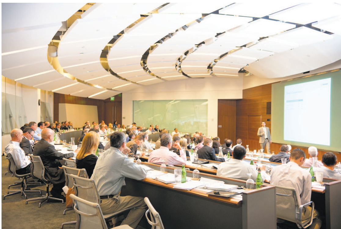
More than 100 advisors came to Dimensional's Austin, Texas, headquarters for two days of seminars.

Advisors selling DFA funds have monthly or quarterly meetings with one another, facilitated by a DFA manager, to discuss portfolio and practice manage-